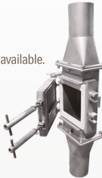
See Fig. 1