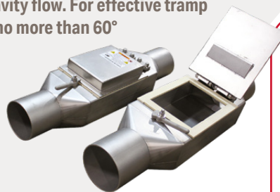
See Fig. 1